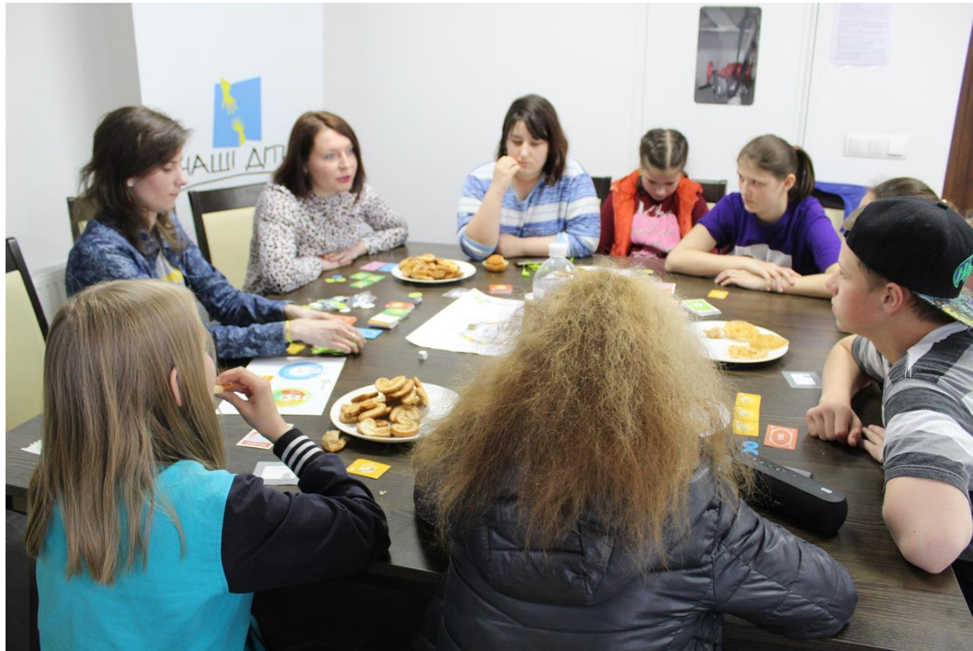
Playing in “Our Children Center”