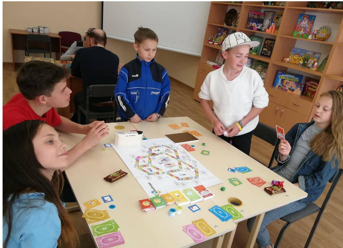
Playing in Kharkiv